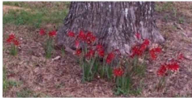
Ox Blood Lilies at The Herb Cottage, Hallettsville, TX