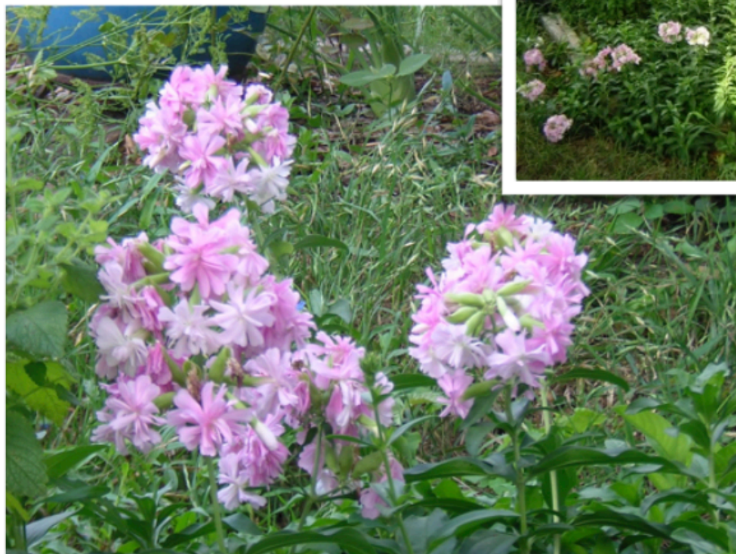
Soapwort at The Herb Cottage